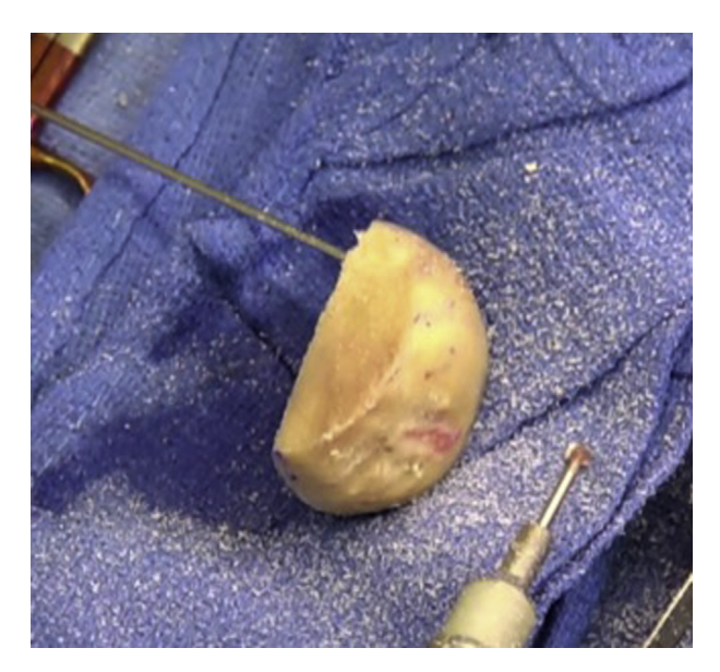
Figure 4 Femoral head allograft shaped to re-create glenoid defect.

For each patient, the following data were collected based on the preoperative documentation: operative side, side of dominance,