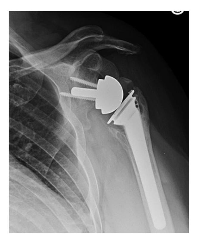
Figure 2 Healed structural glenoid allograft after revision of failed hemiarthroplasty and placement of reverse total shoulder arthroplasty with glenoid allografting.

pin. At this point, the graft was fixated with multiple Kirschner wires (Fig. 5). In the case of a chronic anterior dislocation, the defect was primarily anterior; therefore, a wedge of femoral head was prepared after the dimensions of bone loss were measured. The graft was temporarily stabilized with Kirschner wires and