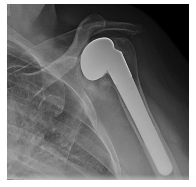
Figure 1 Failed hemiarthroplasty with superior glenoid erosion.

pin. At this point, the graft was fixated with multiple Kirschner wires (Fig. 5). In the case of a chronic anterior dislocation, the defect was primarily anterior; therefore, a wedge of femoral head was prepared after the dimensions of bone loss were measured. The graft was temporarily stabilized with Kirschner wires and